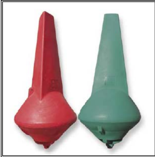
PB700 Buoys, Port and Starboard Configuration.

Lightweight Buoy for use in shallow, sheltered water with various possible applications and configurations