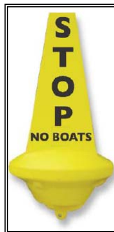
PB600 with optional lettering to mark a 'no-go zone' for boats.