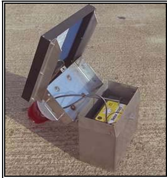
PS20/100 showing easy access to battery.